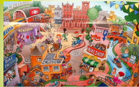
CTC vision of Utopia